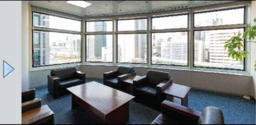
Showroom in Japan – Interior appearance